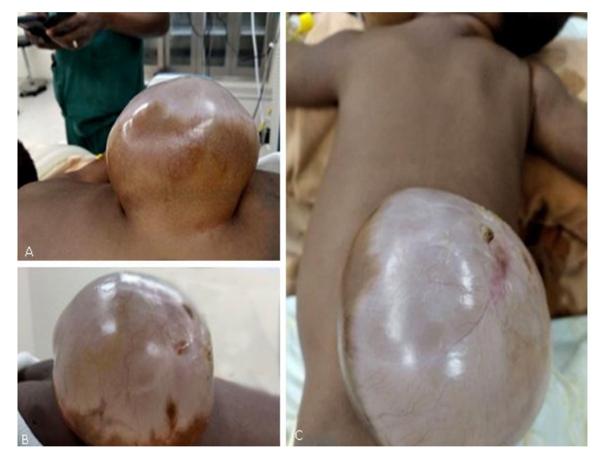
Fig. 3 - A) Left lateral image, B) Right lateral image, C) Superior, of MMC. Note epithelialization of exposed dural elements, and great tension of the sac.

Female patient, two months old. No history of consanguinity. The mother received folate supplements in the last trimester. She is brought to the consultation after two months of birth, where extensive spinal dysraphism is found, apparently meningocele, with little neural material inside the sac, and signs of epithelialization at the lumbar level. On neurological evaluation, bilateral femoral motor defect to painful stimulus, without extensor plantar response (Babinski). Surgical intervention is carried out, where epitalized dural elements are resected, and vitalized neural plate is found inside the sac, which is dissected and preserved. He is discharged on the fifth day, after completing antimicrobial therapy. He has no complications during follow-up (fig. 3).